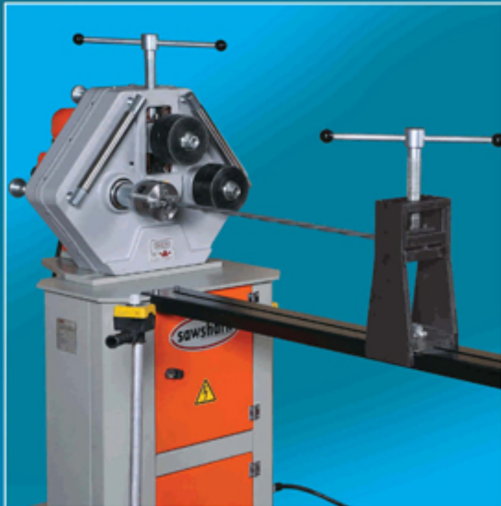
Büküm Aparatı (Opsiyonel) Bending Apparatus (Optional)